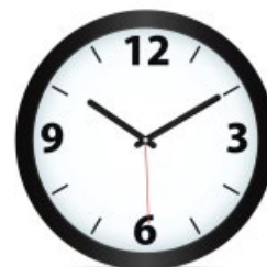
What time shall we meet?