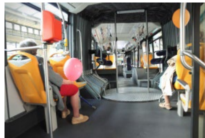
by bus, tram, metro

Useful language for planning a trip: if possible, local children can ‘teach’ refugee partners expressions like the following (and ask them how to say the same thing in Ukrainian):