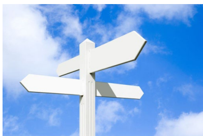
Where shall we go?

Discuss questions like the following with your group, if possible, local children and refugee children can talk in pairs or small groups.