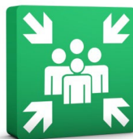
Where shall we meet?